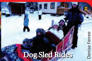
Dog Sled Rides