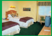
Moose Lodge Room