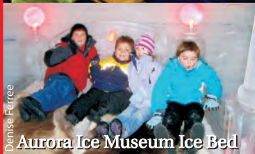
Aurora Ice Museum Ice Bed