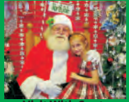
Visit With Santa