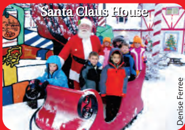
Santa Claus House