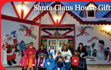
Santa Claus House Gift Shop, North Pole