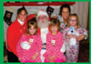
Family Fun with Santa

* Optional Snow Coach Aurora Viewing Tour additional $75pp adult, $37.50pp child (ages 12 & under). Check in Activity Center