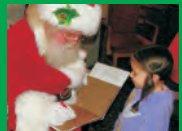
Santa Book Signing