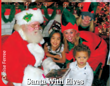
Santa With Elves