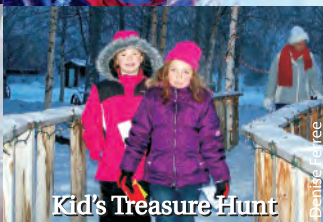
Kid's Treasure Hunt